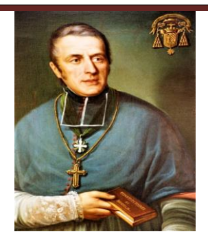
12 MAY 2024

St. Eugene De Mazenod 72A Dunbeath Drive Burpengary - 4505 Phone: 07 38883973