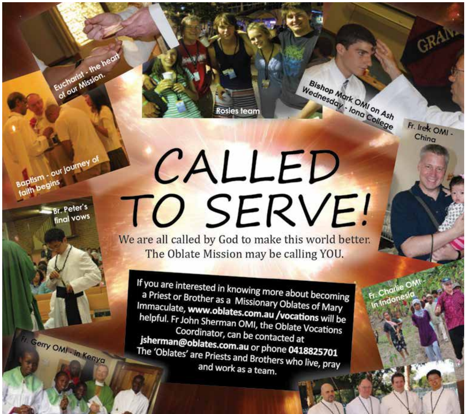
Eucharist - the heart of our Mission.