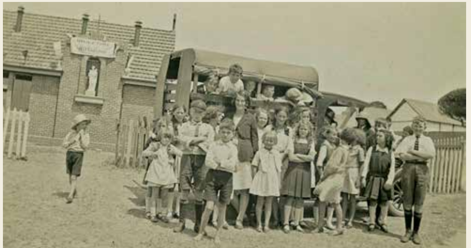
"The Archbishop's Bus" – First Catholic School Bus in Australia